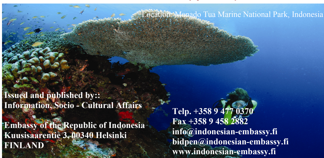
Location: Manado Tua Marine National Park, Indonesia

Majapahit Travel Fair 2009 held in Surabaya, Indonesia. Further information, please visit www.majapahittravelfair.com